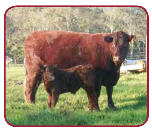
ASHWOOD SNOWBELL 20 with two day old bull calf by ASHWOOD KNOCKOUT

ASHWOOD KNOCKOUT, our back to back "Ekka" Grand Champion bull is also earning his keep with his first calves now making an entrance. We expect we will be proudly offering some of these at our 2019 sale.